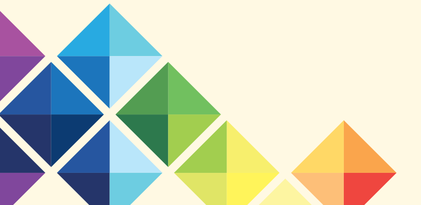
Congrats to the Class of 2023! Read more on pages 7-8.